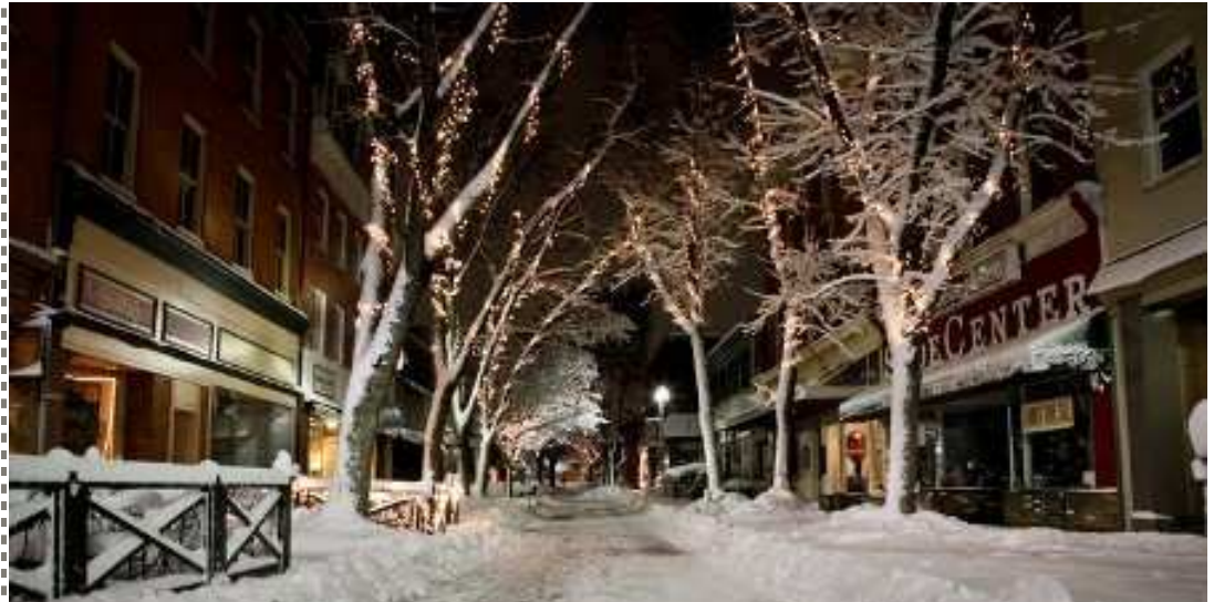
This is a photo from the Pedestrian Mall in Winchester Va, location of the 2011 Main Street Managers' Retreat.