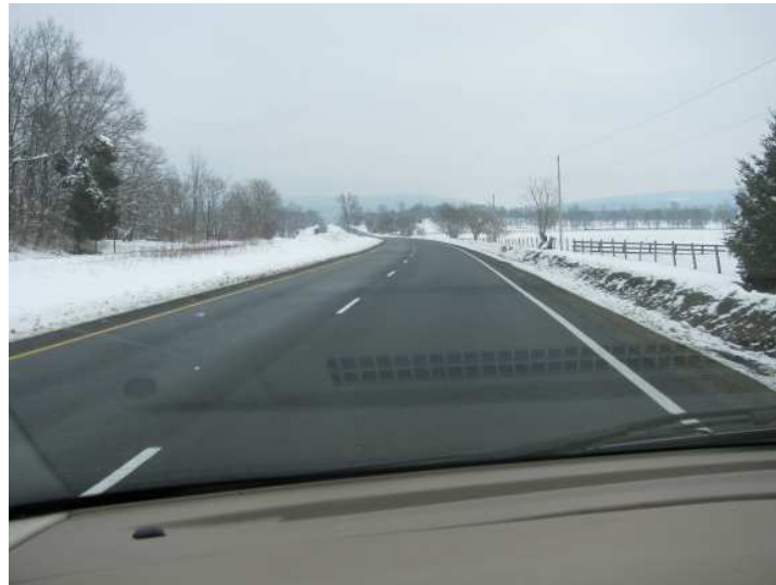
The return trip was much less treacherous since the temperatures had risen and roads had been cleared by then.