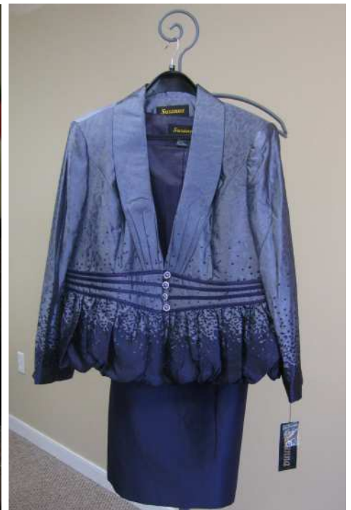
Above and below are examples of the latest fashions available to choose from at the House of Fashions.