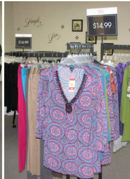
Prices are very reasonable. In fact, everything in the store is $29.99 or less!