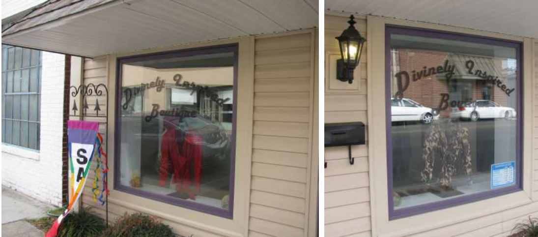
The front windows simply say "Divinely Inspired Boutique" on the glass.

The newest business to open downtown is Divinely Inspired Boutique located at 118 West Broad Street next door to Town and Country Cleaners directly across the street from Winn Furniture.